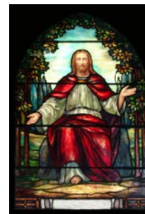
Stained Glass Window 5093: At the Seat of Power