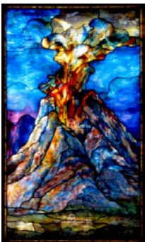
Stained Glass Window 2903: Tiffany Volcano