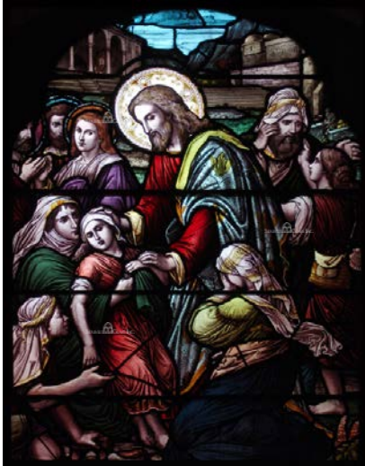
Stained Glass Window 3269: Christ Healing