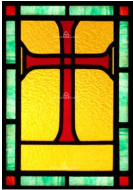
Stained Glass Window 2833: Red Cross Window