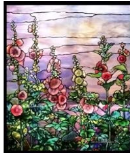
Stained Glass Window 2897: Tiffany Hollyhocks