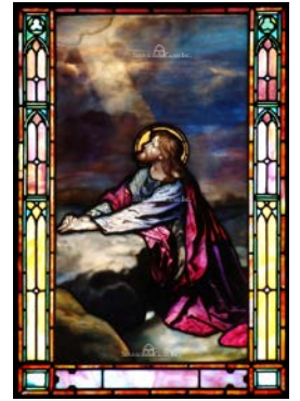
Stained Glass Window 1249: Jesus' Appeal