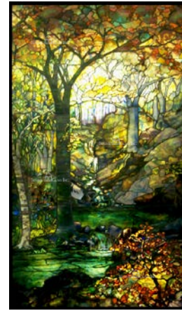
Stained Glass Window 5208: Tiffany Woods