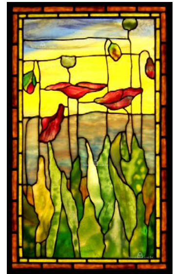
Stained Glass Window 2918: Poppies Tiffany