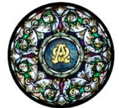
Stained Glass Window 5509: Alpha and Omega Dial

© 2018 STAINED GLASS INC. ALL RIGHTS RESERVED. US PATENT PENDING. PROTECTED BY US AND INTERNATIONAL INTELLECTUAL PROPERTY LAWS.