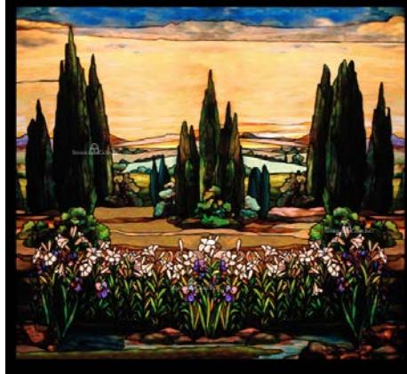
Stained Glass Window 2920: Landscape with Yellow Sky