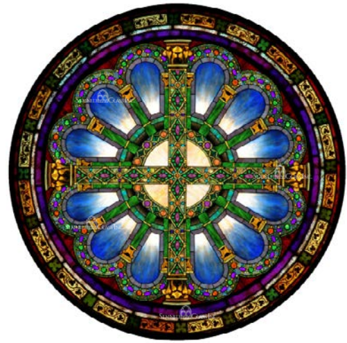
Stained Glass Window 2738: Crossed Columns Rose Window

Stained glass art was most prevalent in the Middle Ages. Huge cathedrals were being built during medieval times. These cathedrals were the first examples of Gothic architecture . Their characteristics featured the pointed arch, the ribbed vault and the flying buttress. It was only appropriate, with the hugeness and detail of these cathedrals, to incorporate stained glass art windows . Most of the population, at this time, was illiterate and stained glass art windows were used to depict stories from the Bible. These stained glass art windows beautifully illustrated the Bible and added color to cathedrals as they were built very large to match the Gothic style. During this time Gothic stained glass art spread all over Europe, from France to Germany and Italy.