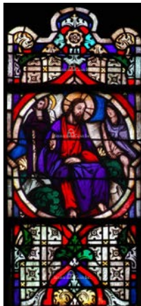
Stained Glass Window 1198: Jesus Preaching the Gospel