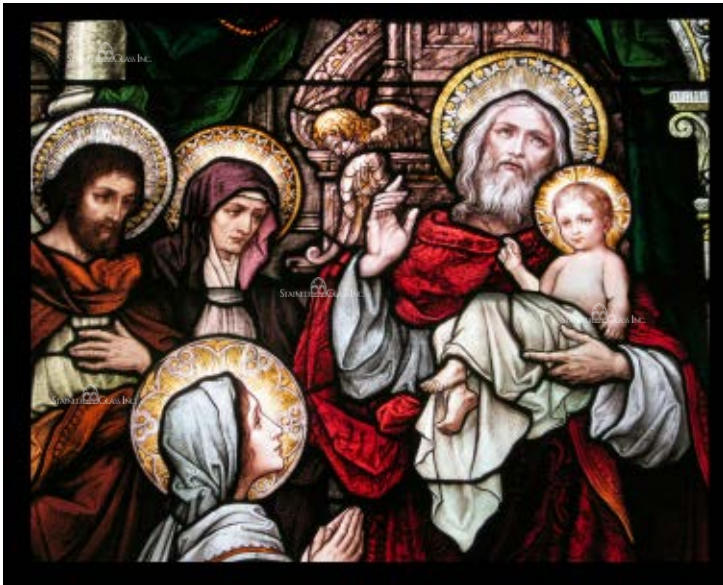
Stained Glass Window 3924: Presentation of Christ the Child

In the mid 1800's stained glass art studios began to pop up in the United States. The most popular stained glass artist from this time is Louis Comfort Tiffany . Tiffany received several patents for stained glass art and started using copper foil instead of lead in windows, lamps and other decorations . Art Nouveau stained glass design flourished in France and Eastern Europe, where it can be identified by the use of curving sinuous lines in the lead and swirling motifs.