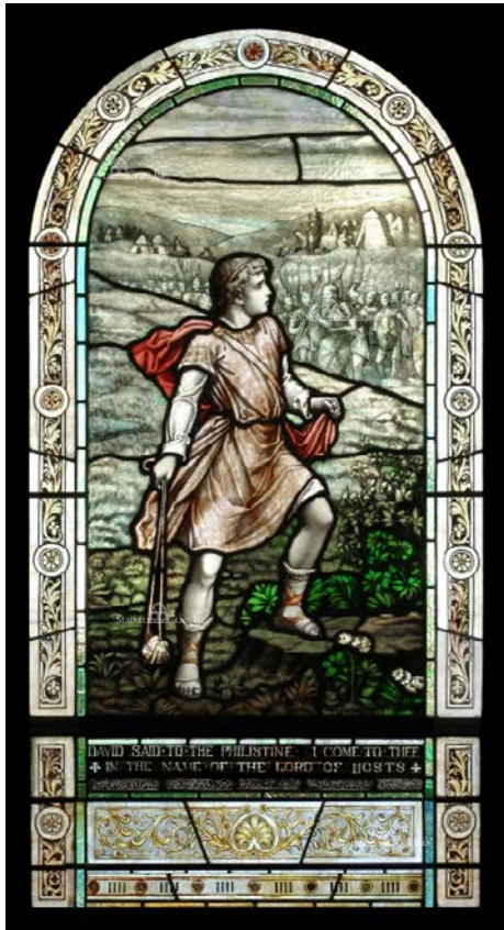
Stained Glass Window 2076: Faithful David

The purpose of stained glass art is not to block the sunlight but to actually manipulate and create beauty with the light. Because of this, stained glass art windows have been called 'illuminated wall decorations'. Stained glass art creates a kaleidoscope of colorful light that will brighten any room and fascinate its visitors. Stained glass art has not always been used primarily for windows. Stained glass art