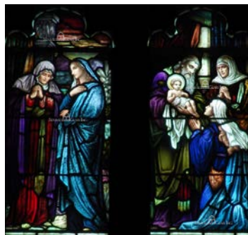
Stained Glass Window 1198: Jesus Preaching the Gospel