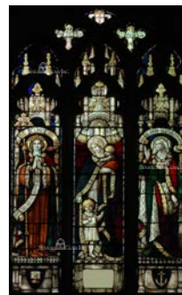
Stained Glass Window 3200: Madonna and Saints