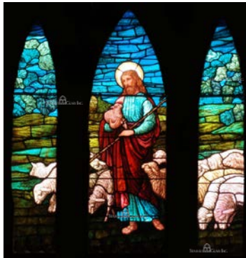
Stained Glass Window 4956: Jesus and the Lost Sheep