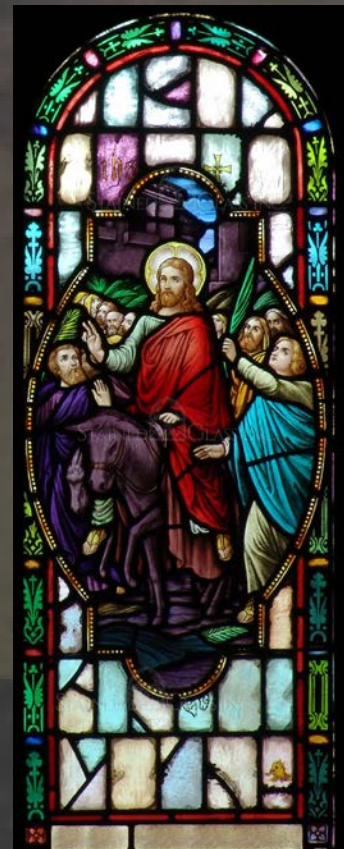
Stained Glass Window 2047: Jesus Enters Jerusalem

According to the Bible, Jesus sent His disciples