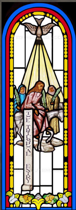
Stained Glass Window 5243: The Triumphal Entry of Jesus