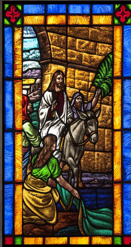
Stained Glass Window 12101: Riding on a Donkey