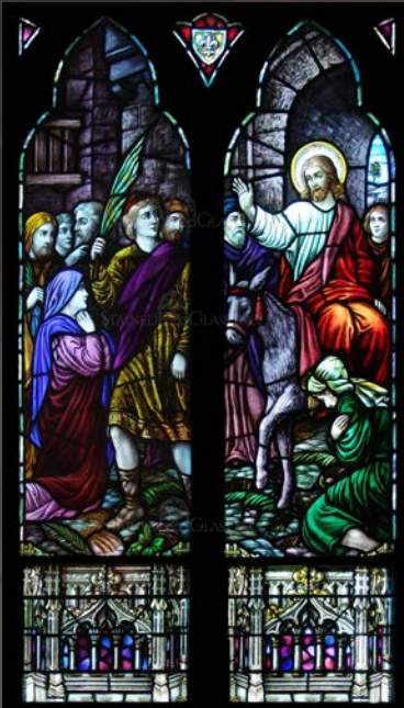
Stained Glass Window 1873: Riding Into Jerusalem