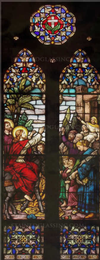
Stained Glass Window 1400: The Triumphal Entry