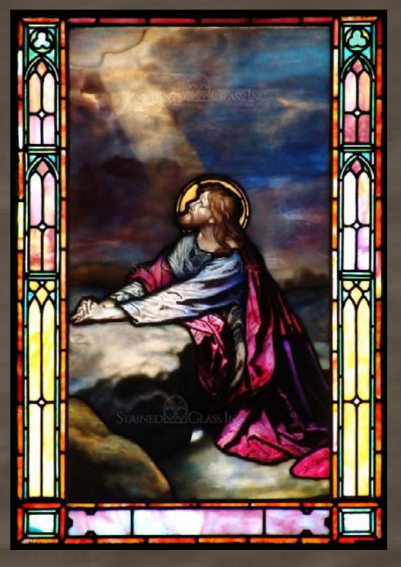
Stained Glass Window 1249: Jesus' Appeal