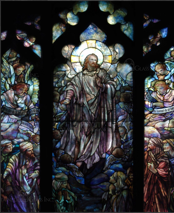
Stained Glass Inc. Panel 4916: This Same Jesus