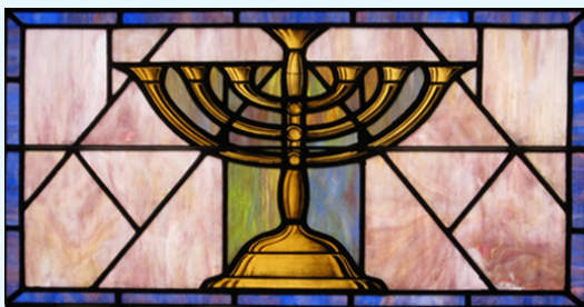
Menorah in Stained Glass

The origin of the menorah was the seven-branched candelabrum which was carried by the Israelites and used in the sanctuary as they journeyed through the Sinai desert. In art, the menorah was used to illuminate manuscripts and began to appear in stained glass images during the Middle Ages.