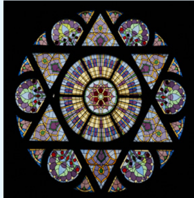
Round Stained Glass Synagogue window of the Star of David

Also referred to as the Star of David, the six-pointed star is used in stained glass and other Jewish art. The Star of David, created by two interlaced triangles, is based on the symbol from David's shield.