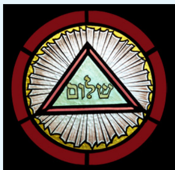
Shalom stained glass window roundel. Also available a square, rectangular, octagon or other window shapes

The inscriptions used in synagogue stained glass artworks are most often biblical verses suitable for creating a mood for prayer. These include Shalom (Peace), as well as "How lovely are Thy tabernacles, O Lord of hosts" ( Psalms 84:2 ), "Know before whom you stand" ( Berachot 28b ), "o give thanks unto the Lord, call upon His name" ( Psalms 105:1 ), "O Lord, hear my prayer" ( Psalms 102:2 ), and other quotations.