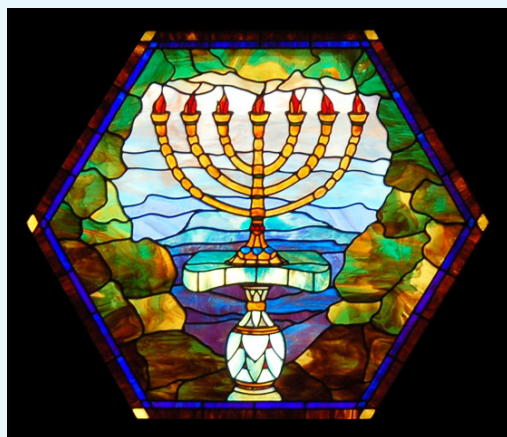
Octagonal Menorah window (Also available as round, square or in any other shape or size)