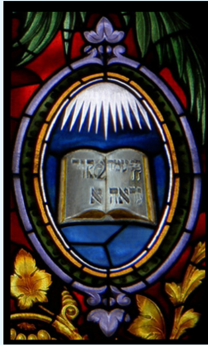
The Ten Commandments