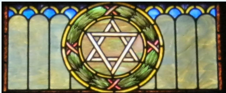
Star of David in Wreath Stained Glass