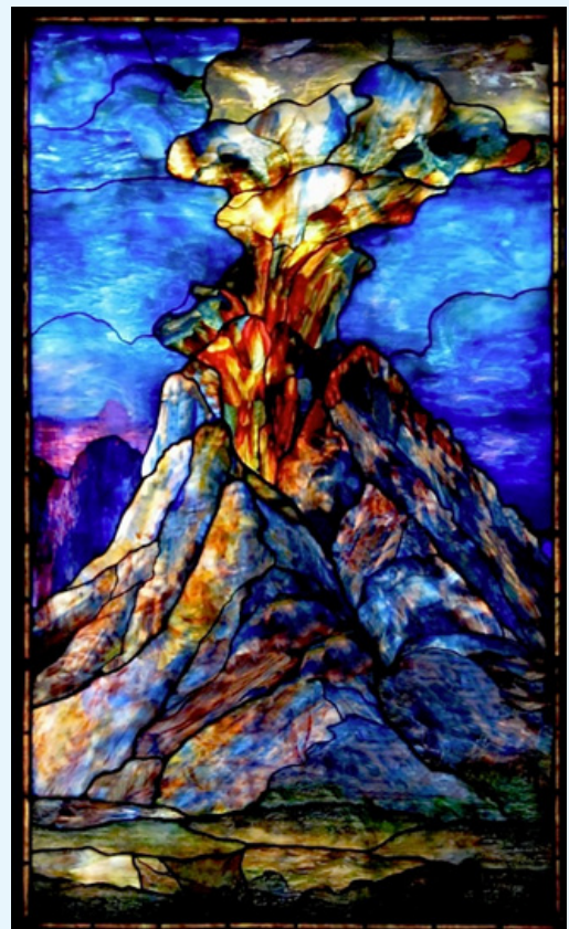
Mt Sinai Window. Based on a Tiffany stained glass design.

From the day that Moses was commanded to build a tabernacle in the desert, temple art and architecture has developed along biblical lines. Synagogue stained glass can feature a wide range of symbols and emblems that are characteristically Jewish; the menorah, the lamp, the interlacing triangles, the Lion of Judah, and flower and fruit forms are all allowable in most Orthodox synagogues. Stained Glass Inc panels can serve as Temple windows, door inserts, partitions and feature walls. Jewish stained glass windows can follow a variety of styles and subject matter, a few possible themes of Synagogue windows and partitions include the following: