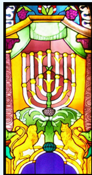
Synagogue window featuring the Menorah