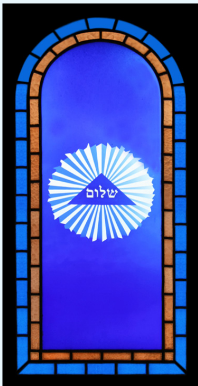
Shalom on blue glass window

Hebrew script can be an art form in its own right and can be featured in stained glass either alone or in combination with a decorative element. The Hebrew inscriptions in stained glass serve both to embellish the synagogue as well as to instruct the congregation.