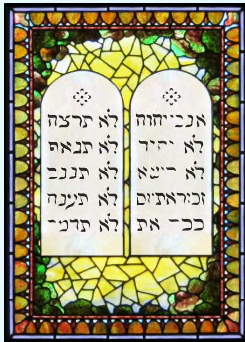
Aseret ha-Dibrot: The "Ten Commandments" in Stained Glass