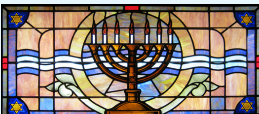
Menorah in Stained Glass