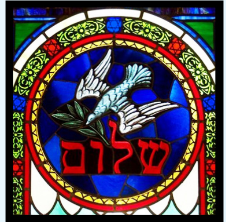
Shalom dove window