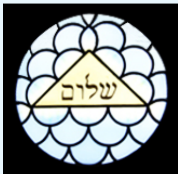
Shalom window roundel