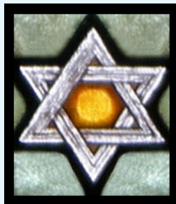
Star of David in Stained Glass