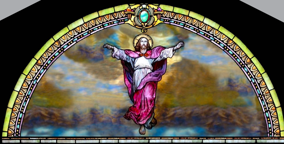
Ascension Transom – Arms spread wide, Christ ascends to his throne in Heaven, portrayed in this breathtaking transom work of stained glass art that is perfect for application in a church foyer.